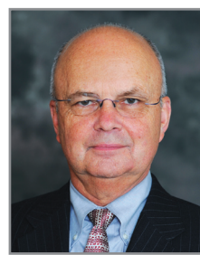
General Michael Hayden

Chairman & Chief Executive Officer Polaris Industries, Inc.